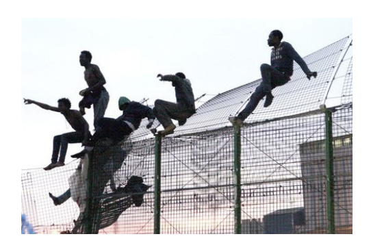
Immigrants attempting to scale 6 meters fences

This is a traveling Seminar and it will take place primarily in three different cities: Sevilla, Jaen and Melilla (North Africa), Students will spend a week in each attending a series of modules and workshops. Some examples are: Human Rights for Refugees; Displaced and Isolated Immigrants; Migrant Policies within Spain regarding Children Traveling Alone; and Social Responsibility and Immigration as Global Citizens. (MENA); among others.